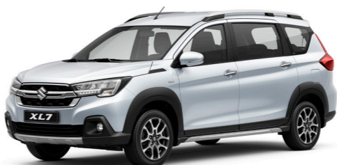
Snow White Pearl