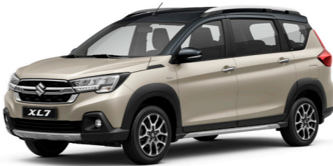
Savanna Ivory Metallic x Cool Black Pearl Metallic