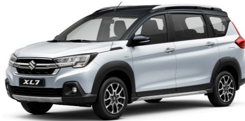
Snow White Pearl x Cool Black Pearl Metallic