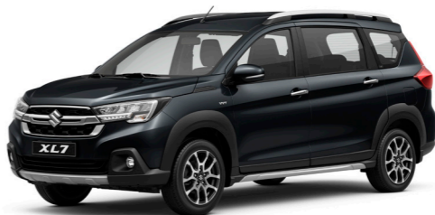
Cool Black Pearl Metallic