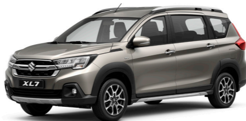
Magma Gray Metallic