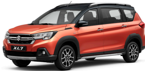
Rising Orange Pearl Metallic x Cool Black Pearl Metallic