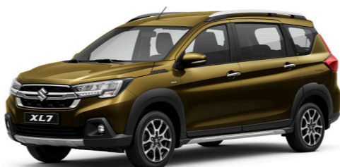
Brave Khaki Pearl